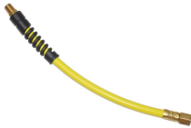
33204 91486357 Hose whip, 3/8" NPT, 10 mm inside diameter, 30 cm (1 ft)