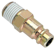
77NMC3 88104088 7N7/7S7 Series nipple, 3/8" male thread, 7.2 mm bore (EURO 7.2 - 7.4)