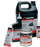
Lubricants For the complete range, see our accessory catalogue.