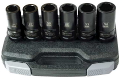
SK6M6LN SK6M6LN 3/4" Impact socket set (6 pcs) (24, 27, 30, 32, 33 and 36 mm)