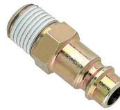
IB8NMC3 88103304 IBN/IBS Series nipple, 3/8" male thread, 8 mm bore (ISO6150B / MIL-C4109)