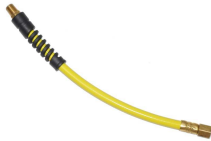
33204 91486357 Hose whip, 3/8" NPT, 10 mm inside diameter, 30 cm (1 ft)