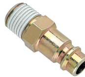
IB8NMC3 88103304 IBN/IBS Series nipple, 3/8" male thread, 8 mm bore (ISO6150B / MIL-C4109)