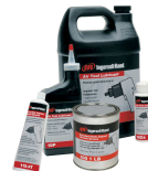
Lubricants For the complete range, see our accessory catalogue.