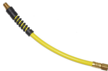
33204 91486357 Hose whip, 3/8" NPT, 10 mm inside diameter, 30 cm (1 ft)