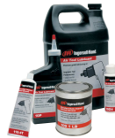
Lubricants For the complete range, see our accessory catalogue.