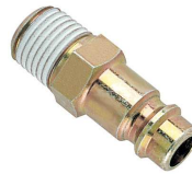
IB8NMC3 88103304 IBN/IBS Series nipple, 3/8" male thread, 8 mm bore (ISO6150B / MIL-C4109)