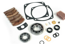
2146-TK2 2146-TK2 Motor service kit