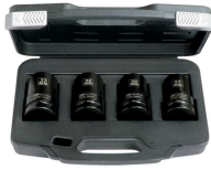
SK8M4LN SK8M4LN 1" Impact socket set (4 pcs) (27, 30, 32 and 33 mm)