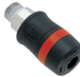
Quick Release Couplings For the complete range, see our accessory catalogue.