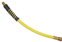
33204 91486357 Hose whip, 3/8" NPT, 10 mm inside diameter, 30 cm (1 ft)