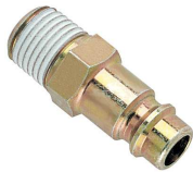
77NMC3 88104088 7N7/7S7 Series nipple, 3/8" male thread, 7.2 mm bore (EURO 7.2 - 7.4)